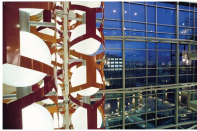
UCSF Mission Bay Campus